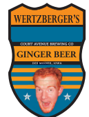
Wertzberger's Ginger Beer (NA)